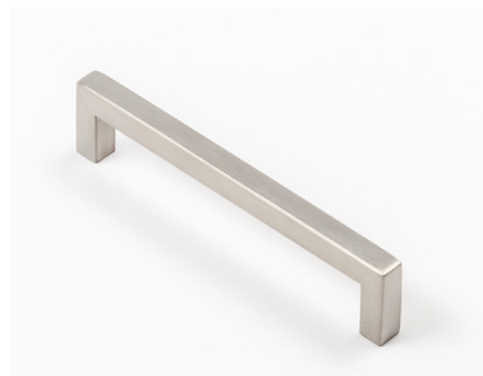
Satin Stainless Steel